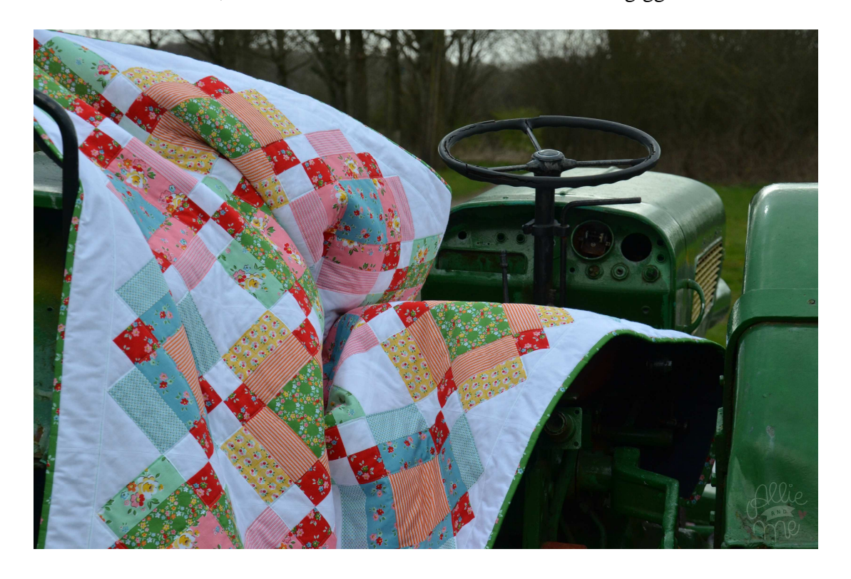
I had to send it with the post because unfortunately the distance is much too far.