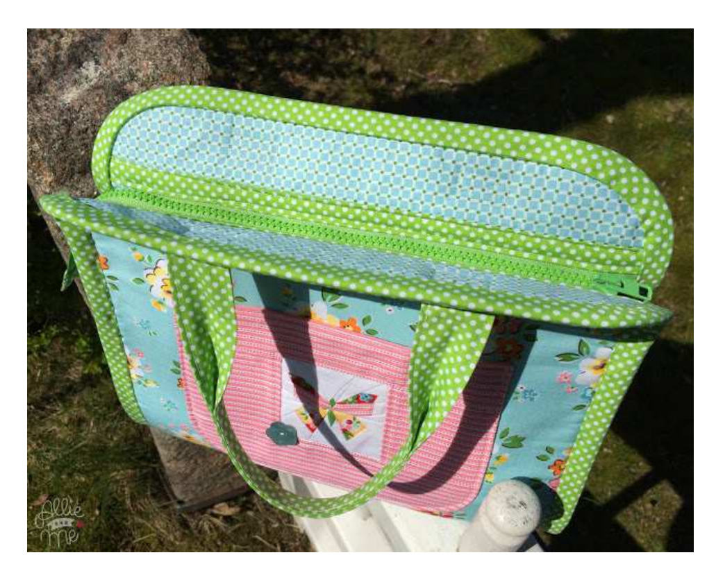
Oh yes! ♥ So true!